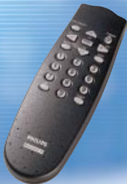
21-Button Total Remote (Remote # RCO702/04)