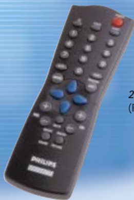
29-Button Total Remote (Remote # RCL9UB/04)