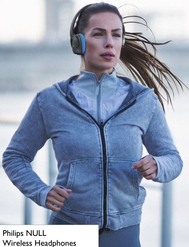
Philips NULL Wireless Headphones

40 mm drivers/closed-back Over-ear Sweat/waterproof