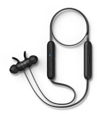
Philips Bluetooth in-ear headphones Philips TAE1205