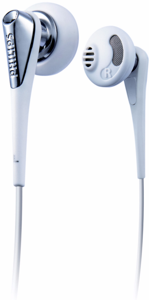
Philips In-Ear Headphones