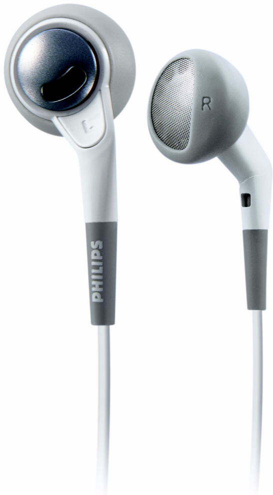
Philips In-Ear Neckstrap Headphones