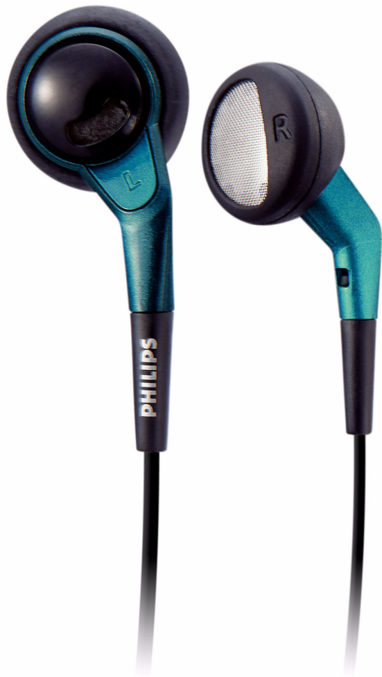
Philips In-Ear Headphones