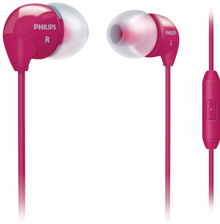
Philips In-Ear Headset