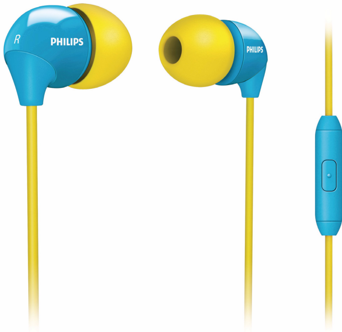
Philips In-Ear Headset