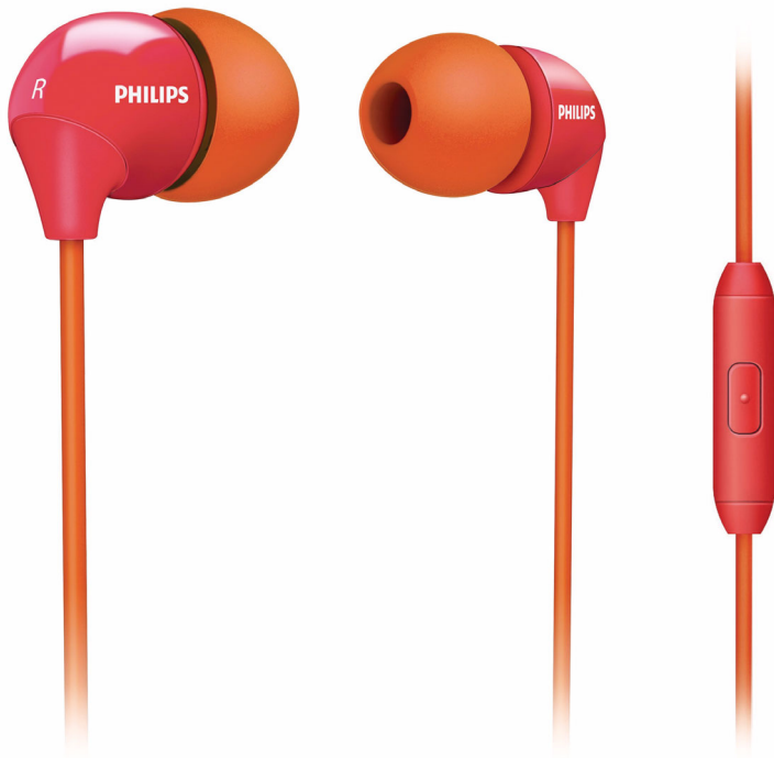
Philips In-Ear Headset