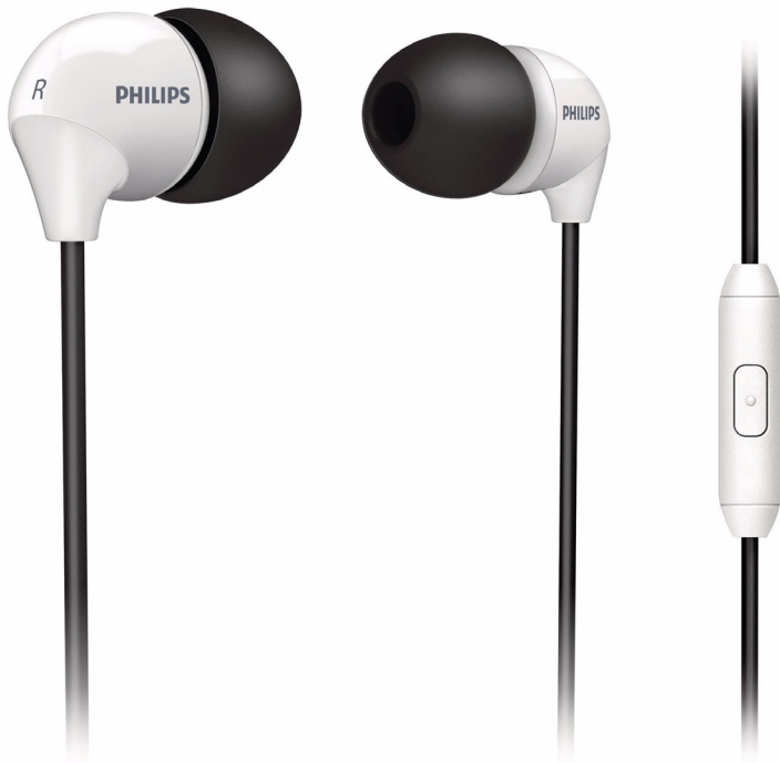
Philips In-Ear Headset