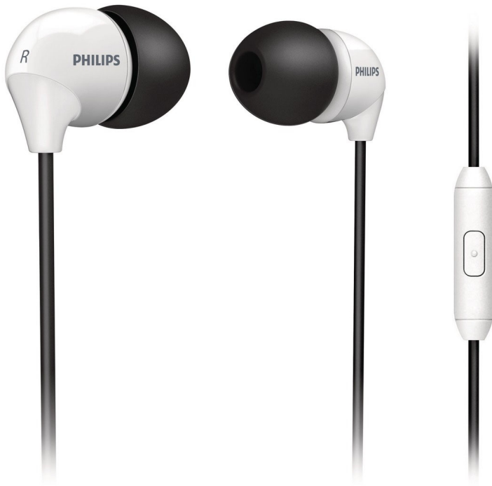
Philips In-Ear Headset