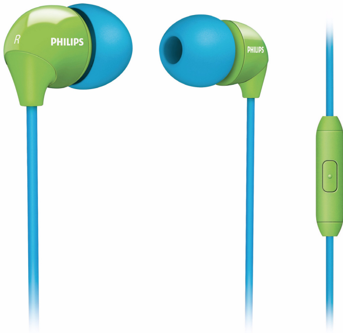
Philips In-Ear Headset