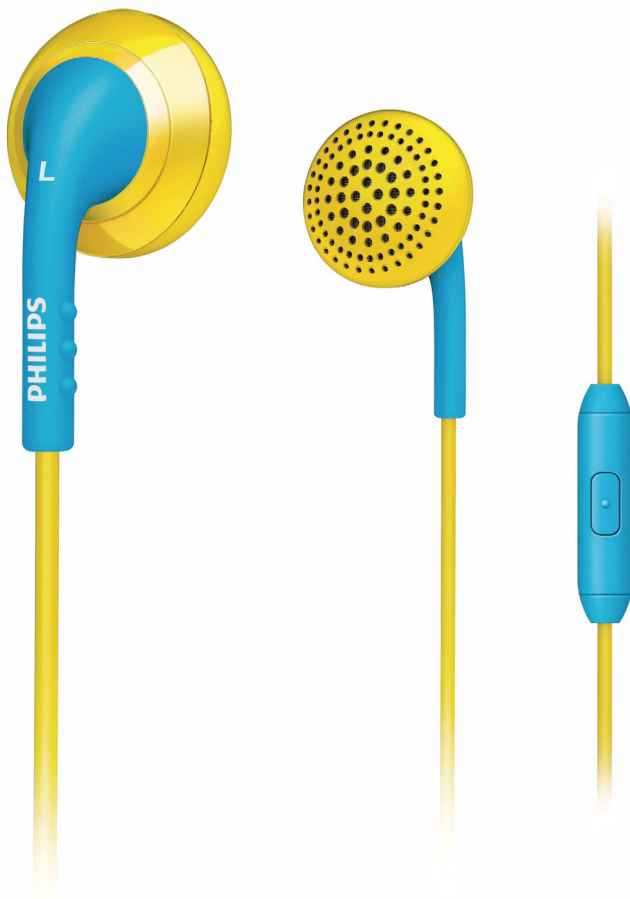
Philips In-Ear Headset