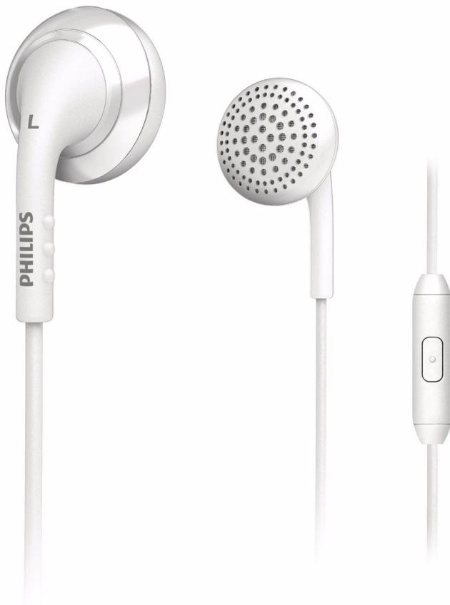
Philips In-Ear Headset