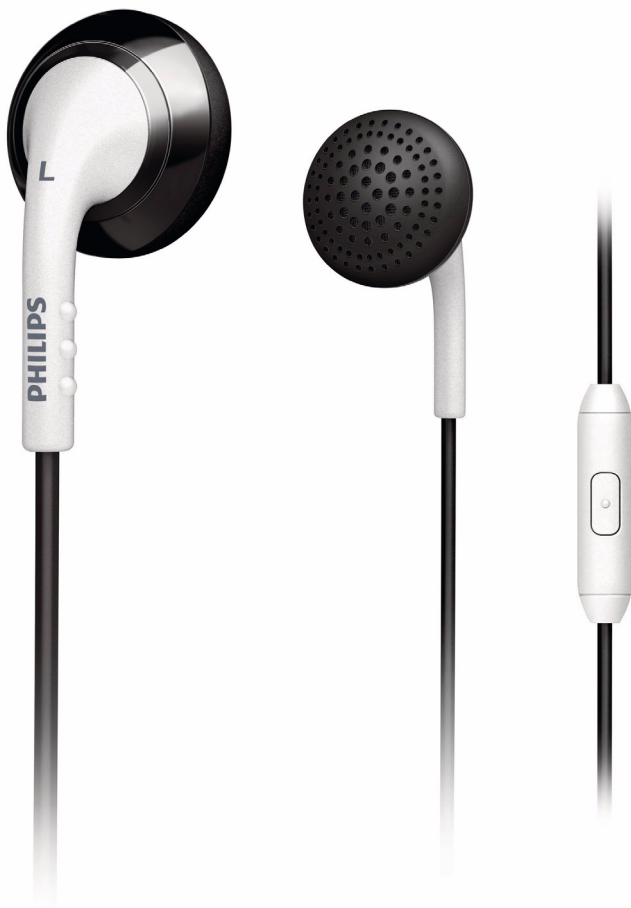
Philips In-Ear Headset