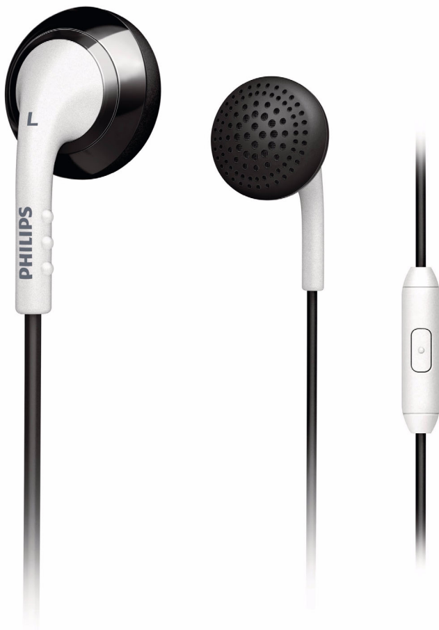
Philips In-Ear Headset