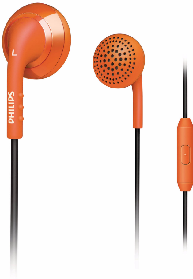
Philips In-Ear Headset