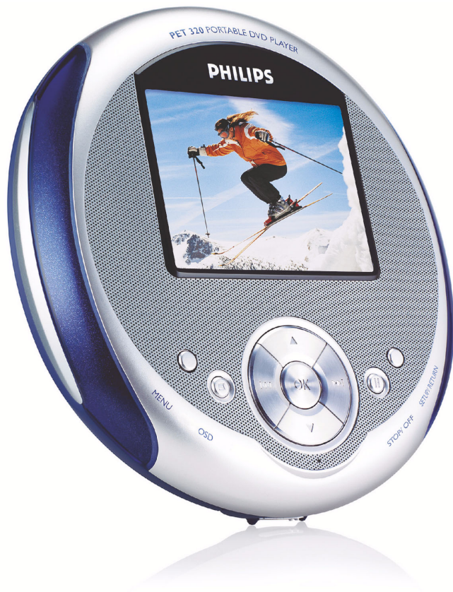
Philips Portable DVD Player