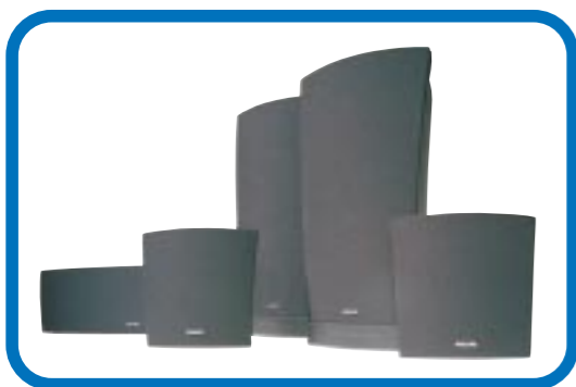
5 Speaker Package