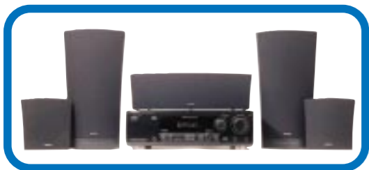
MX735 Home Cinema Package