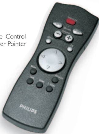
Remote Control with Laser Pointer