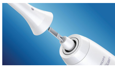
Easy brush head placement and handle cleaning