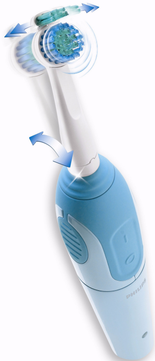
Philips 1600-Series Rechargeable toothbrush