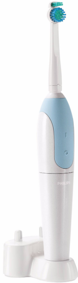
Philips Sonicare Sensiflex Rechargeable toothbrush