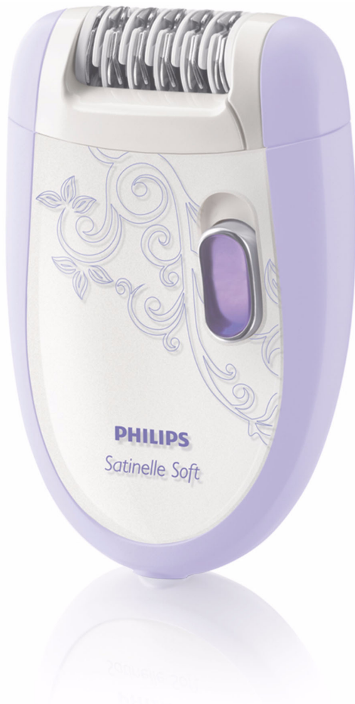
Philips Satinelle Epilator