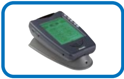
* Optional Touch Screen Remote : Philips 'Pronto'