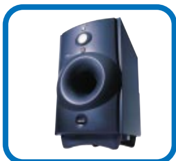
* Recommended subwoofer : Philips FB301