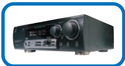
* Black version of FR970