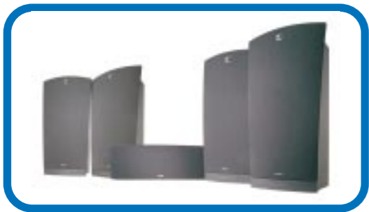
* Recommended speaker package : Philips FB975