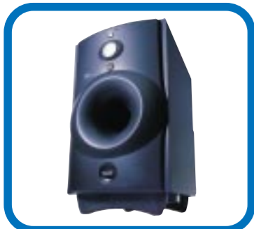
* Recommended subwoofer : Philips FB301