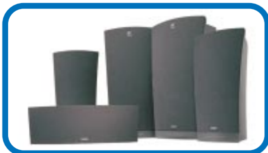
* Recommended speaker package : Philips FB965