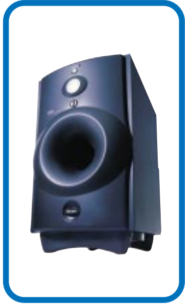
* Recommended subwoofer : Philips FB301