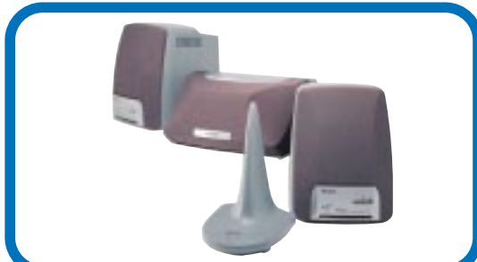
* Wireless surround speaker : Philips FB209W (optional)