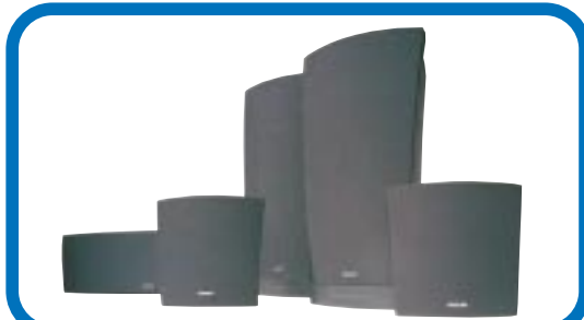
* Recommended speaker package : Philips FB735 (optional)