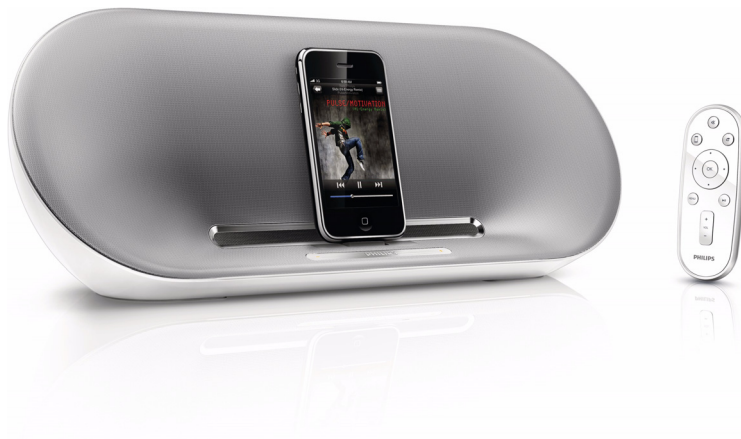
Philips docking speaker