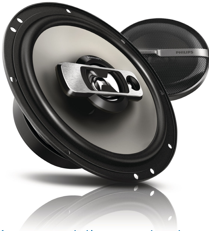
Philips Car coaxial speaker