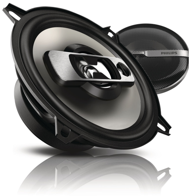
Philips Car coaxial speaker