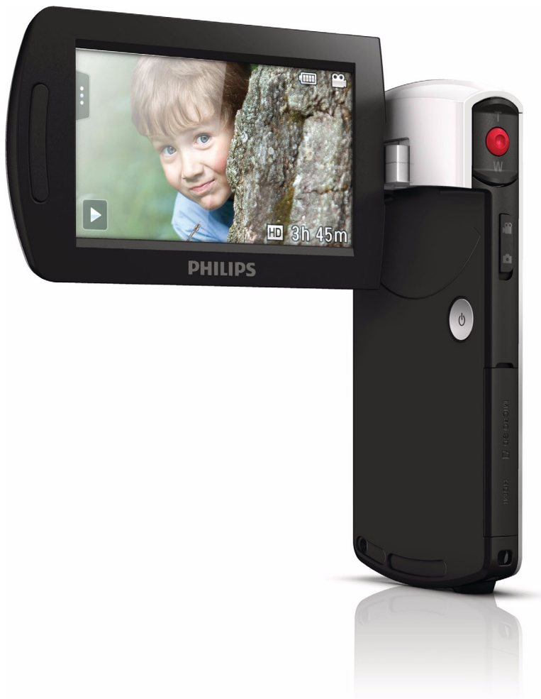
Philips HD camcorder