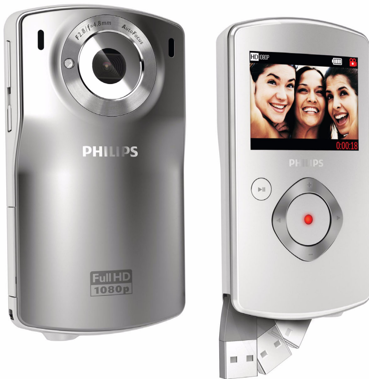
Philips HD camcorder