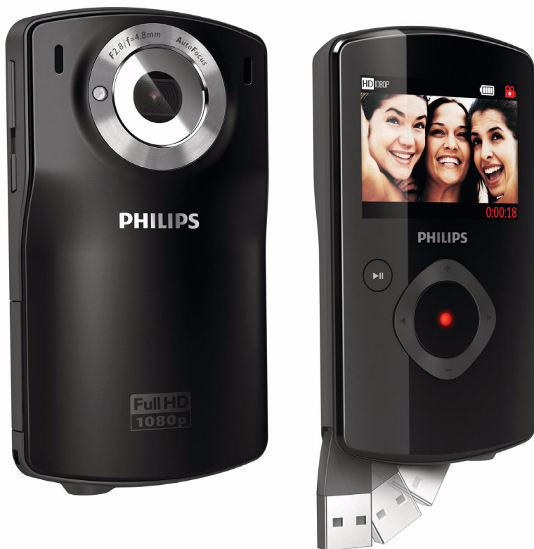
Philips HD camcorder