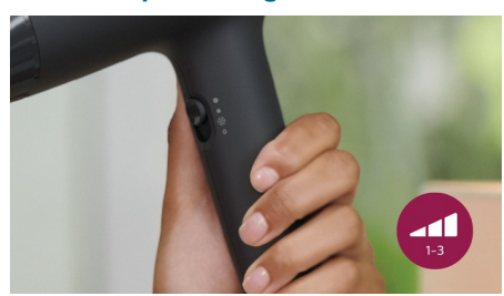
This hairdryer offers 3 preselected heat/speed combinations, making it quick and easy to achieve the perfect style.