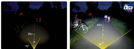
Standard 10 lux