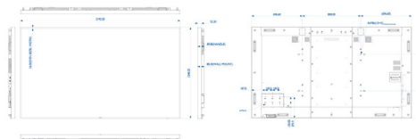
Philips 98BDL4150D www.philips.com