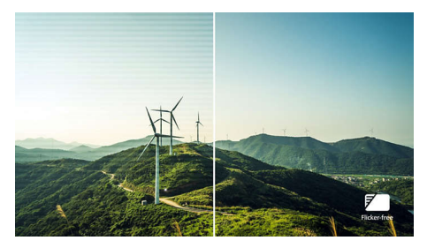
Due to the way brightness is controlled on LED-backlit screens, some users experience flicker on their screen which causes eye fatigue. Philips Flicker-free Technology applies a new solution to regulate brightness and reduce flicker for more comfortable viewing.