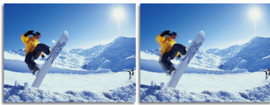
2ms GtG response time > 2ms GtG response time

Turbo modes turns on over drive circuit for best response time, reduce jaggy edges for fast moving objects on screen, enhance contrast ratio for bright and dark scheme, this profile delivers the best gaming and movie experience.