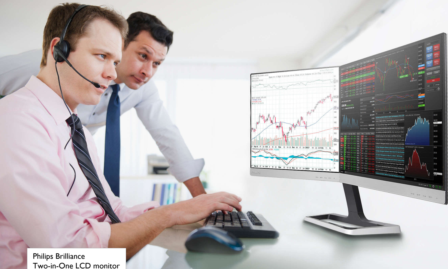
Philips Brilliance Two-in-One LCD monitor