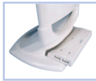
Optional USB Hub attached to standard base PCUH411 (Mist White Only)