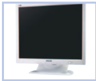
Mist White Model 180B2S