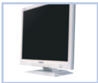
Mist White Model 150S3F