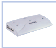
Optional USB Hub attached to standard base PCUH411 (Mist White Only)