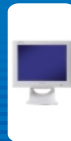
Optional Ergo Base UG3P30