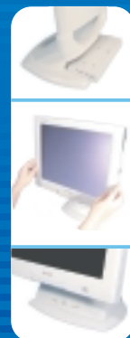
Optional USB HUB PCUH411