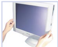
Optional Protective Cover