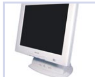
Optional Multimedia Base for Audio and Portrait Capabilities