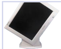
Optional Ergo Base for Portrait Enable Display