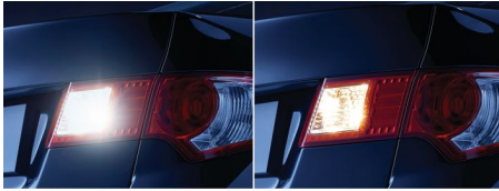
T16 Halogen standard

High power xenon white LED car light, to see and be seen better.